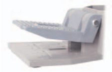
Keine Sicherheitsvorrichtung / None safety mechanism