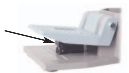
Pedalverriegelung / Pedal lock