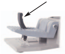
Sicherheitshebel / Safety lever